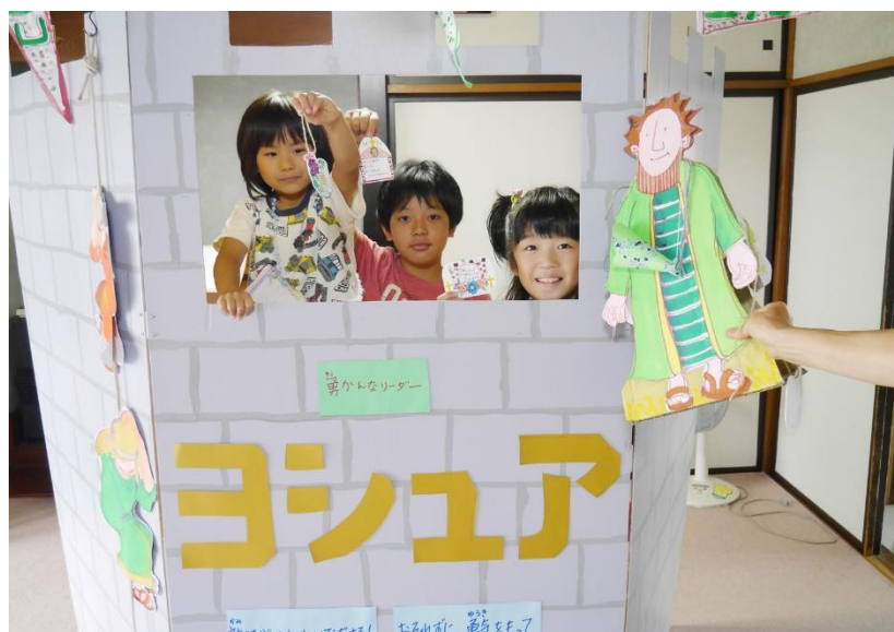
Three children attending Day 1 of our VBS (Big yellow characters say “Joshua” in Japanese.)

We have not given up, of course, witnessing Christ to little ones! We held a three-day VBS on July 28~30. Our theme this year is “Joshua, a Courageous Leader for God’s People.” Since we covered the life of Moses last year, it seemed quite appropriate to take up the life of Joshua, the next leader for God’s people after Moses. It is getting harder in this country to reach children because their time is taken not only by school activities but also by other community & private club activities which often fall on Sundays. Even for covenant children, when they go to Junior High School, life is basically “invaded” by school events, against which the Christian parents usually do not fight but rather give in thinking that school life is more important than their children’s coming to church. Along with this cultural battle, there is that particular problem of rebellion every youth faces, i.e., he wants to go his own way!